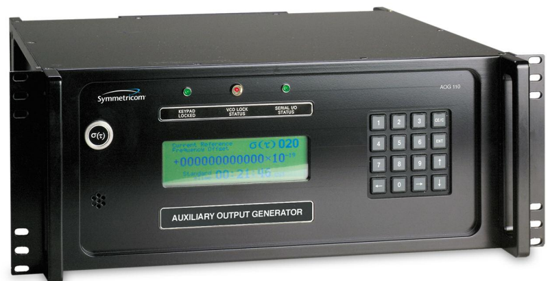
AOG-110 Auxiliary Output Generator

The output frequency is controlled by directly offsetting a phase accumulator (synthesizer) in the PLL chain. The maximum synthesized fractional frequency range is \pm 1E-7 , with a fractional resolution of 1E-19 . By altering the frequency output over a precise time interval, output phase control is achieved. Typically, the user defines the desired phase offset and time interval within which the offset is made. Once set, the AOG-110 automatically implements the appropriate frequency offset and precise time interval. Direct control over both frequency and time interval is available.